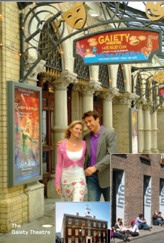
The Gaiety Theatre