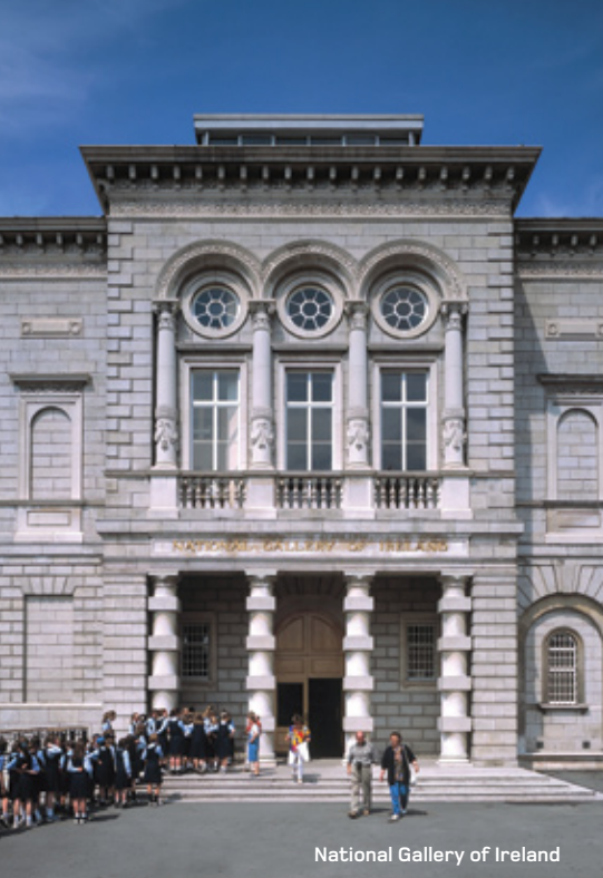
National Gallery of Ireland